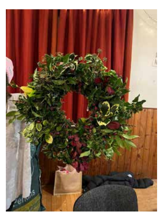
Fundraising for Friends of Ampney Crucis School Charity no. 1042761