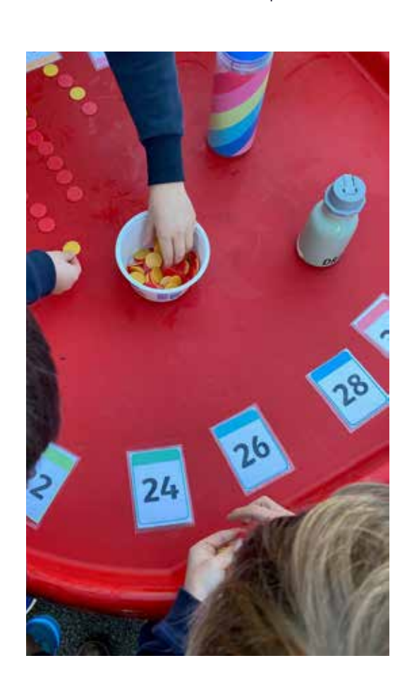
OAK Oak Class pupils enjoying their new science equipment.

"Thank you The Friends. The counters really help with our maths." -Willow Pupil