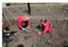
The school allotment