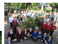
Working with Barlick in Bloom